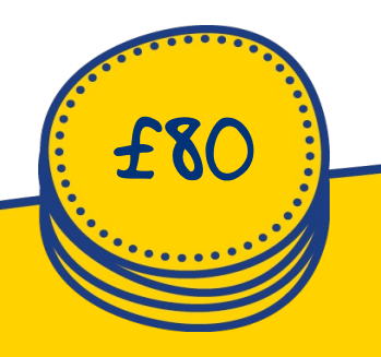
can help pay for a wellbeing session in a local school - to improve pupils' emotional resilience