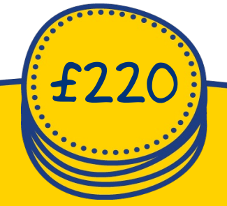
can support 16 people experiencing anxiety or depressoion through our specialist workshops. For many, it will be their first human contact for days.