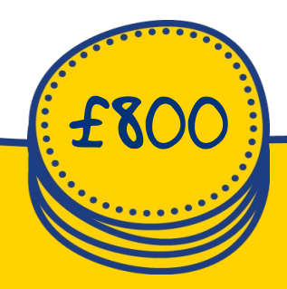
can give 200 local people crisis support, information and reassurance through our Mental Health Information Service